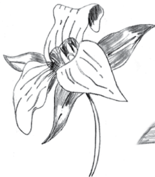
Danielle Saver, 14 Syracuse, NY