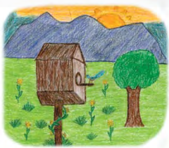
Direll Staffer, 14 Womelsdorf, PA

Want to have your picture or poem published in Nature Friend? Use black ink, dark pencil, colored pencils, or paints on clean, unlined paper, and do not fold drawing. Send to Pictures and Poems, 4253 Woodcock Lane, Dayton, VA 22821, or e-mail to picturesandpoems@naturefriendmagazine.com. Include your name and address. If you want your work returned (whether we use it or not), please include a self-addressed, stamped envelope. Space is limited, so it is not possible to publish every submission.