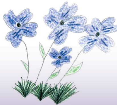
Lynnae Raber, 10 Antrim, OH