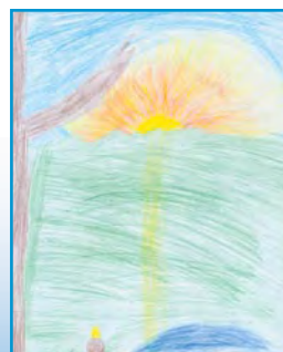
James Lavon Yoder, 7 Reedsville, WI

Want to have your picture or poem published in Nature Friend? Use black ink, dark pencil, colored pencils, or paints on clean, unlined paper , and do not fold drawing. Send to Pictures and Poems, 4253 Woodcock Lane, Dayton, VA 22821, or e-mail to picturesandpoems@naturefriendmagazine.com . Include your name and address. If you want your work returned (whether we use it or not), please include a self-addressed, stamped envelope. Space is limited, so it is not possible to publish every submission.