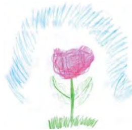
Solveig Weinberg, 7 Front Royal, VA