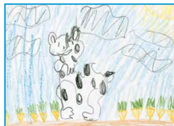
Hope Rose Ashlers, 6 Pendleton, KY